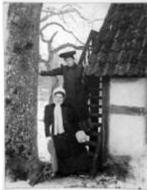
"Mazais Unguriņš" (1907.)